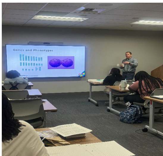
STAR 2.0 Classroom